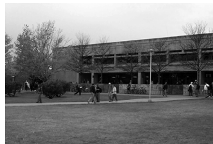
Dean's Office – Candelaria Hall

(1997), Dean — B.A., College of Saint Catherine, Ph.D., University of Wisconsin, Milwaukee