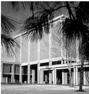
Dean's Office – McKee Hall