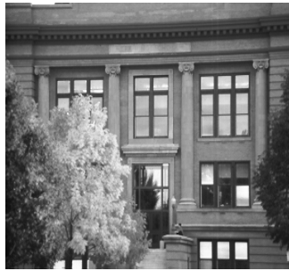
Dean's Office – Kepner Hall

(1994), Interim Associate Dean — B.S., Kansas State University; J.D., George Washington University