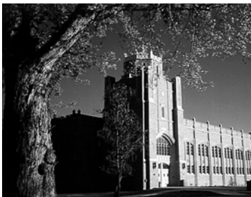
Dean's Office – Gunter Hall