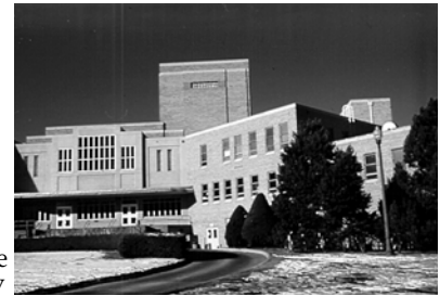
Dean's Office – Frasier Hall

(2001), Dean — B.M., East Carolina University; M.M., Southern Illinois University-Edwardsville; D.M., The Florida State University