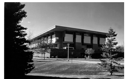
Dean's Office - Michener Library

(1987), Dean — B.A., M.A., University of Wisconsin, Milwaukee; Ed.S., Appalachian State University; Ed.D., University of Northern Colorado