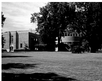
General Administration Offices are located in Carter Hall.

Note: The UNC administration is listed with highest degree following the name. Parentheses is the first year of employment at UNC followed by degrees conferred.