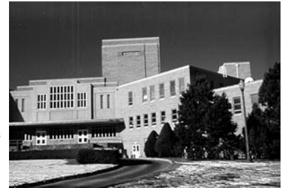
Dean's Office – Frasier Hall

(1988), Interim Dean – B.M., Centenary College; M.M., Indiana University; D.M.A., North Texas State University (G) (DR)