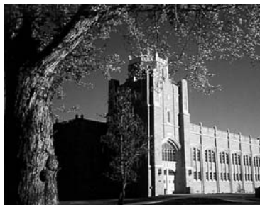
Dean's Office – Gunter Hall