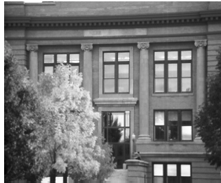
Dean's Office – Kepner Hall

(1973), Dean – B.A., State University of New York; Ph.D., University of Northern Colorado (G)