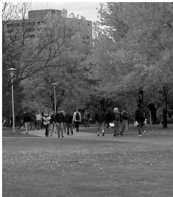
TABLE OF CONTENTS – A&S