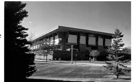
Dean's Office - Michener Library

(1987), Dean – B.A., M.A., University of Wisconsin, Milwaukee; Ed.S., Appalachian State University; Ed.D., University of Northern Colorado