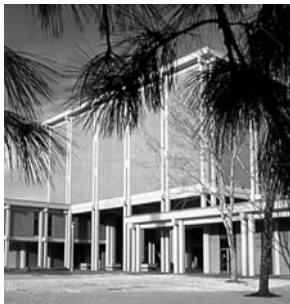
Dean's Office – McKee Hall