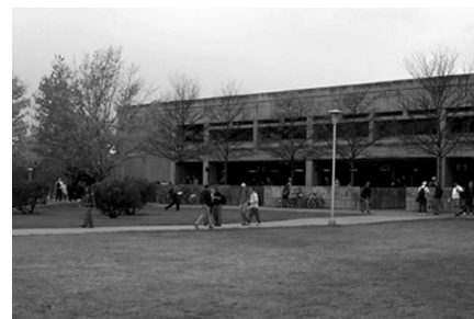
Dean's Office – Candelaria Hall 30

(1997), Dean – B.A., College of Saint Catherine, Ph.D., University of Wisconsin, Milwaukee